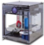
BFB 3D Touch